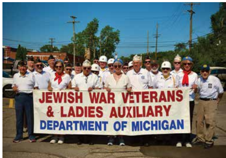
On July 4, the Jewish War Veterans and Ladies Auxiliary, Department of Michigan, marched in the Annual Oak Park, Michigan Independence Day Parade.