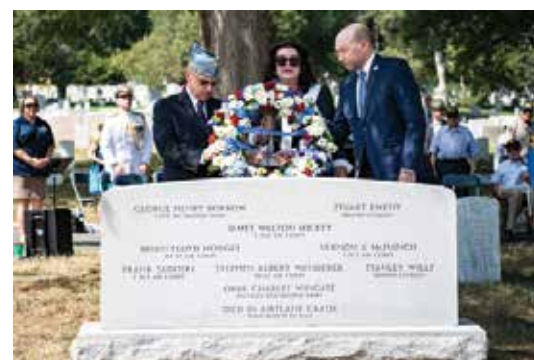
Wreath Laying Ceremony

We have a current list of activities helping us complete these goals. These include providing articles to the JWV Newsletter Women's Calendar, and the Women Veterans' Museum exhibit. We'd also like to help states organize their Women Veterans' Day celebrations. Finally, we'd like to partner with American Legion Women Veterans Committee, as they have extensive information and programs.