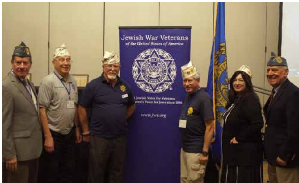
Representatives from numerous posts and departments represented their respective homes at the 128th Annual Convention 2nd Business Session.

National Achievement Awards and Youth Achievement Awards applications will be posted Oct. 1 on the JWV website.