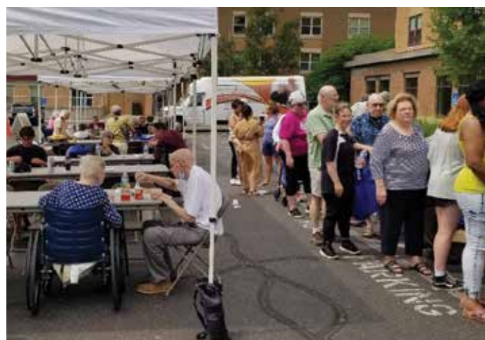
JWV Department of Minnesota hosted a cookout with Kosher lunches, potato salad and a variety of chips and soda.