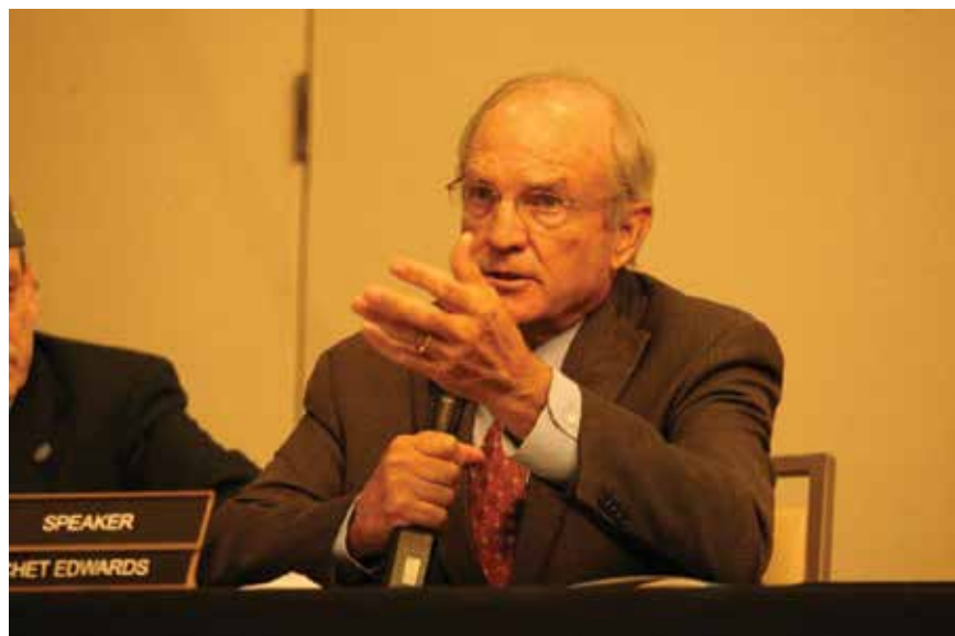
Former Texas Congressman Chet Edwards spoke at the National Convention.

Both encouraged members to promote and establish local relationships with media, press and TV stations. Reach out to local Jewish publications and develop partnerships with Jewish Community Organizations like Hillel, Federations, Synagogues, and day schools.