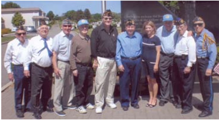
Members of the LT James I. Platt Post 65 of Fairlawn, NJ, participated in Memorial Day Services at Cedar Park Cemetery, Paramus, NJ.