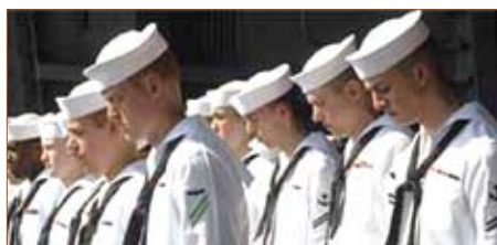
Burial at Sea Page 11

Organized 1896 Official Publication of the Jewish War Veterans of the United States of America