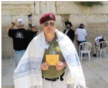
A Jump for Israel's Birthday Page 9